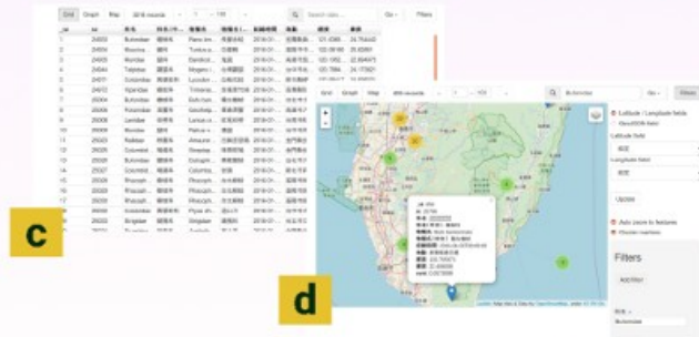
(c) Tabular data is previewed and queried as a spreadsheet. (d) Tabular data with coordinates is visualized over a base map; an entry in the table is displayed at its location.