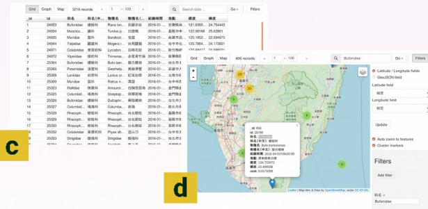
(c) Tabular data is previewed and queried as a spreadsheet. (d) Tabular data with coordinates is visualized over a base map; an entry in the table is displayed at its location.